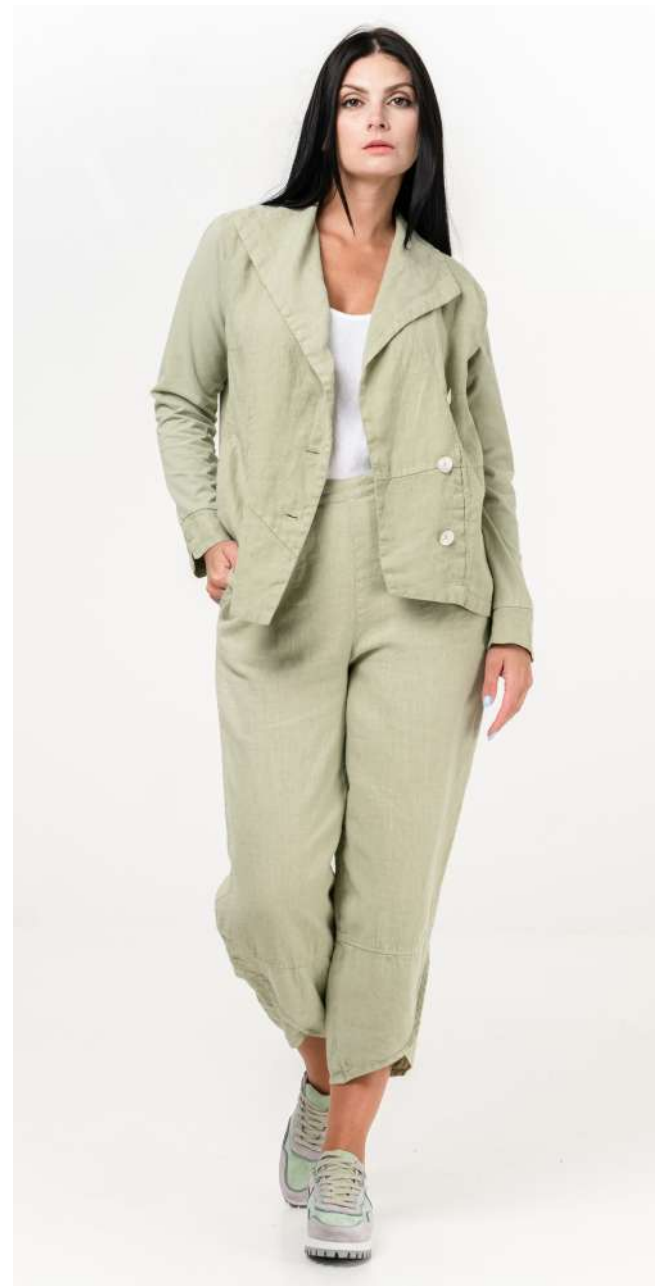
Jacket 1016 / Trousers 454