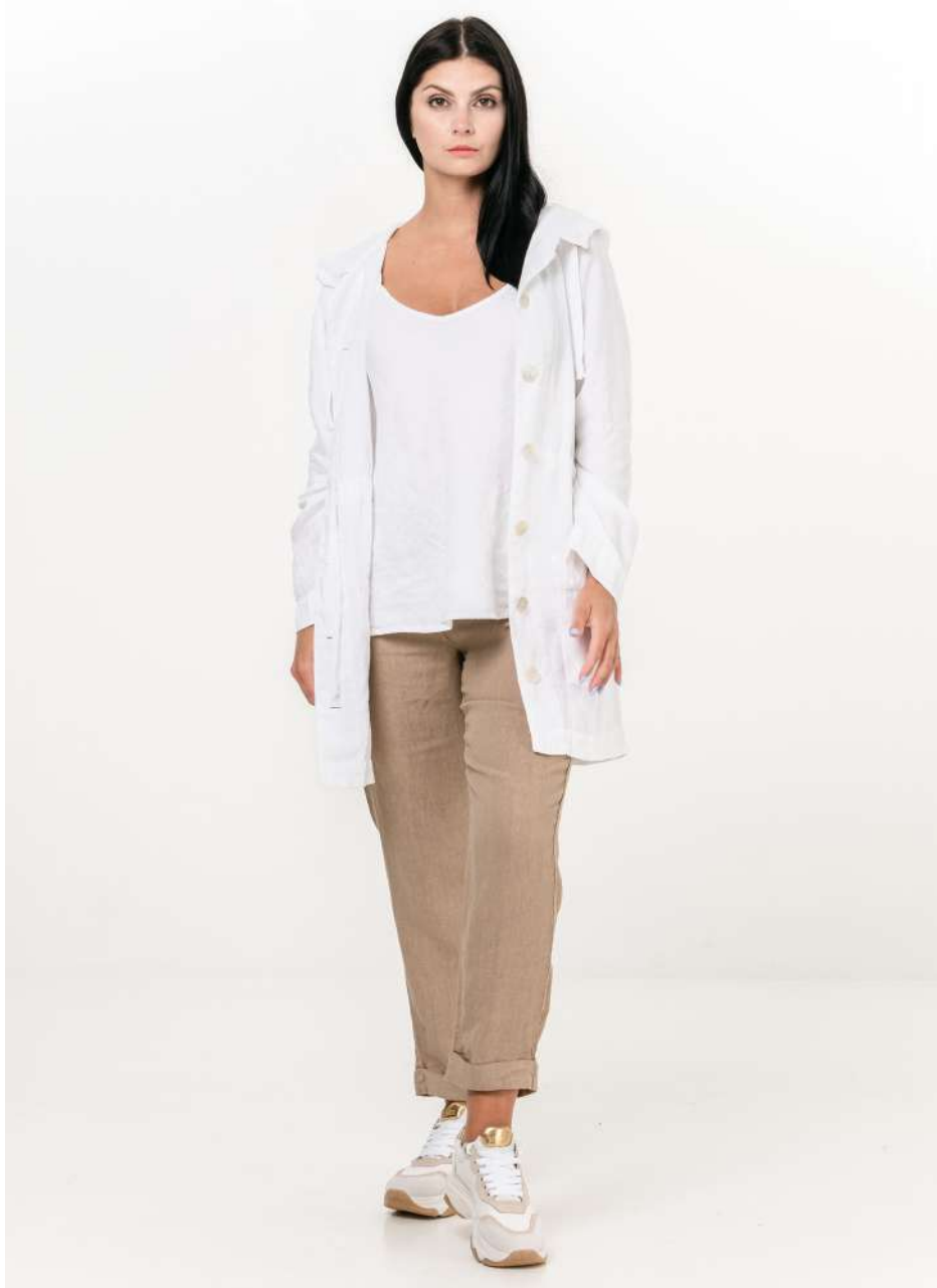
Jacket 1070 / Trousers 449