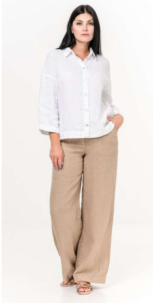
Shirt 4013 / Trousers 1002