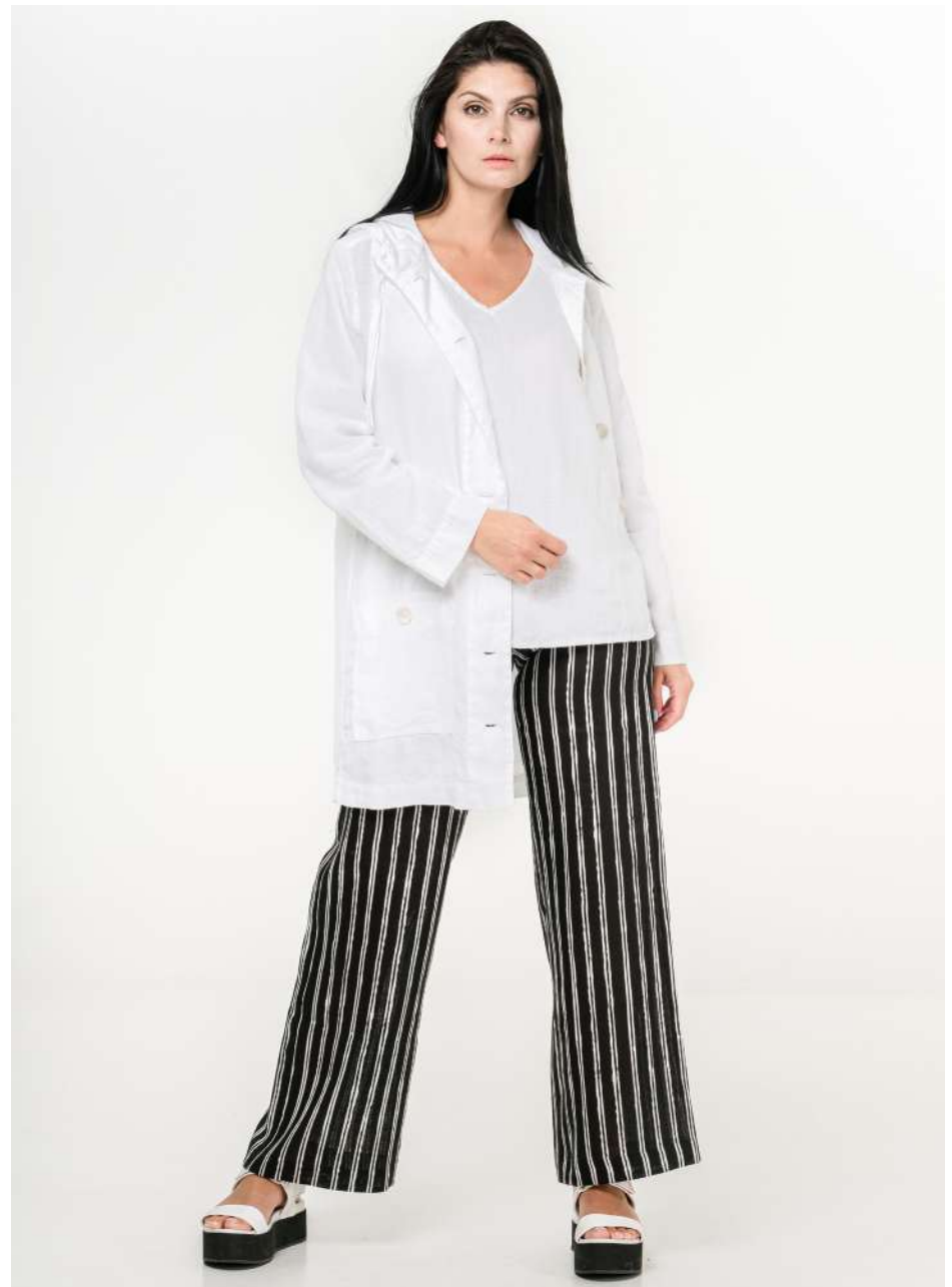
Jacket 1070 / Trousers 026