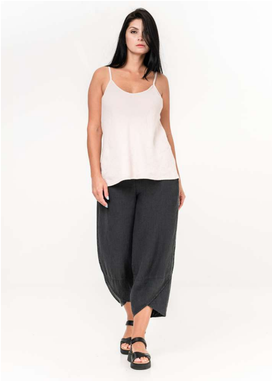
Top 020 / Trousers 454