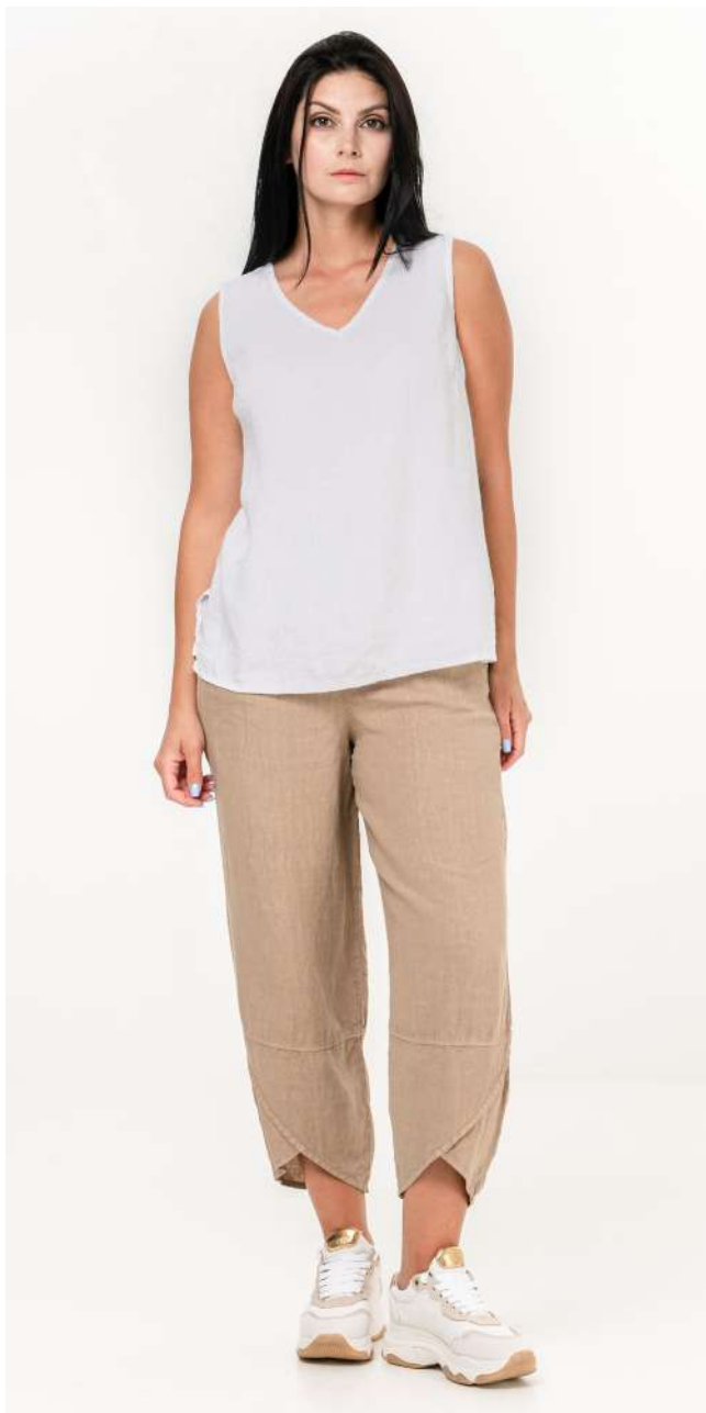
Top 030 / Trousers 454