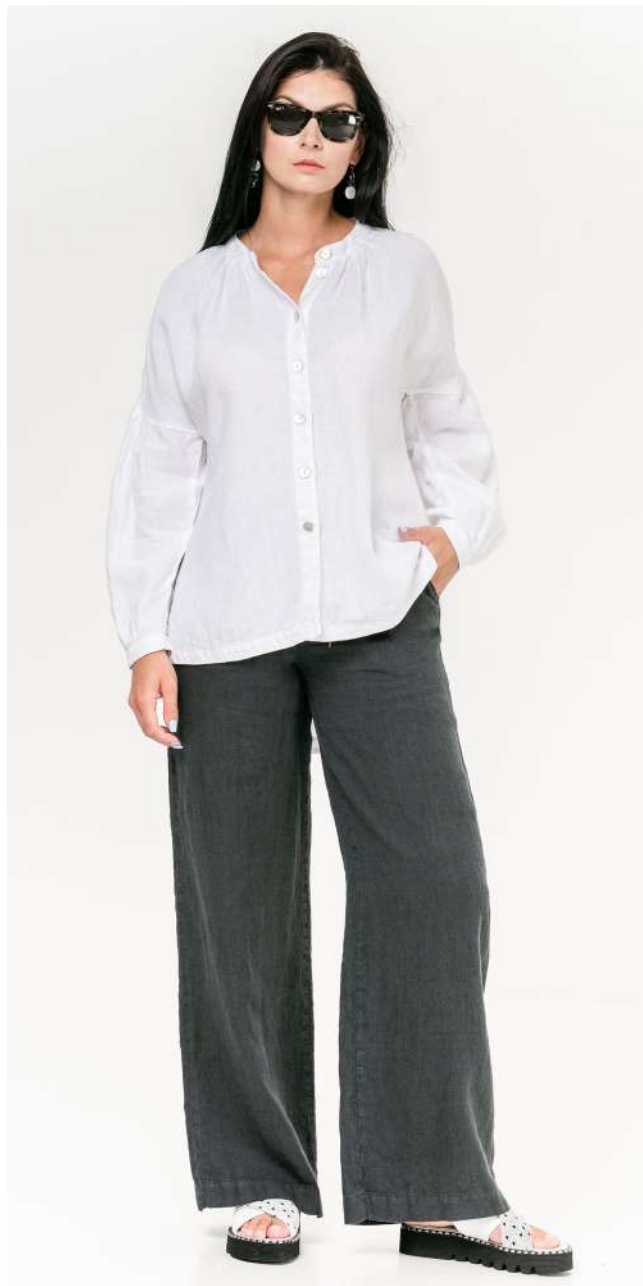
Shirt 4597 / Trousers 1002