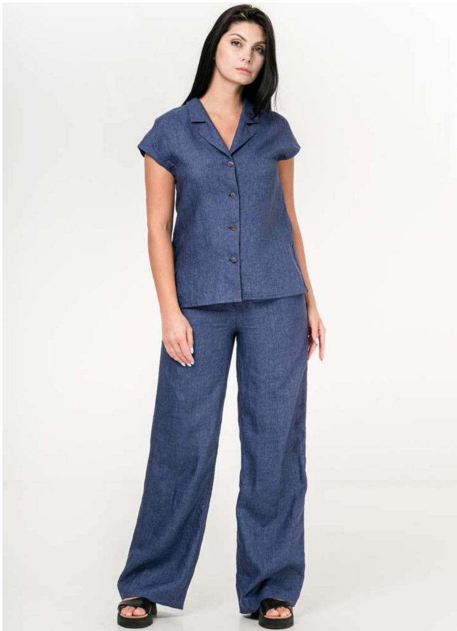
Shirt 8068 / Trousers 8069