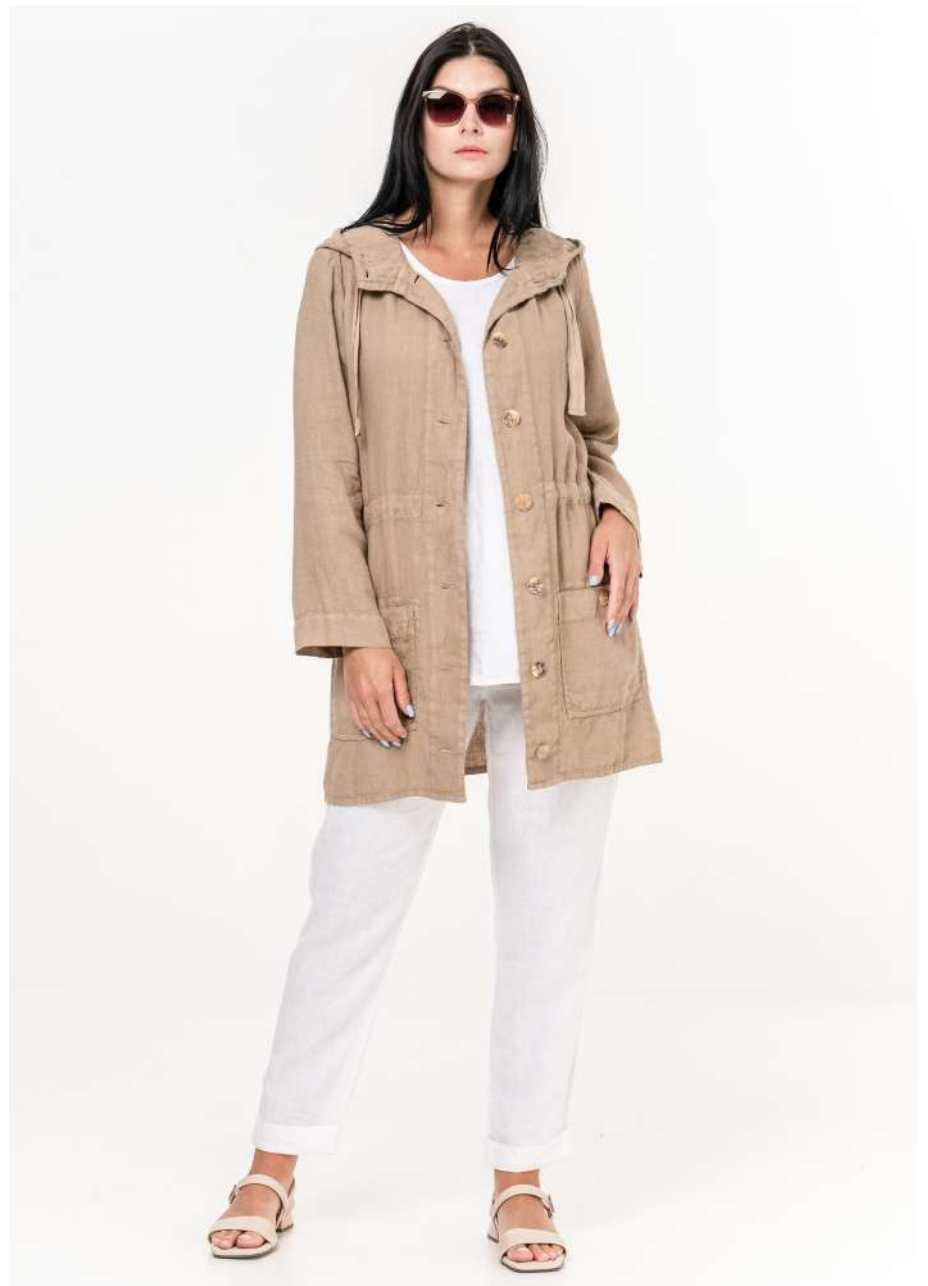
Jacket 1070 / Trousers 449