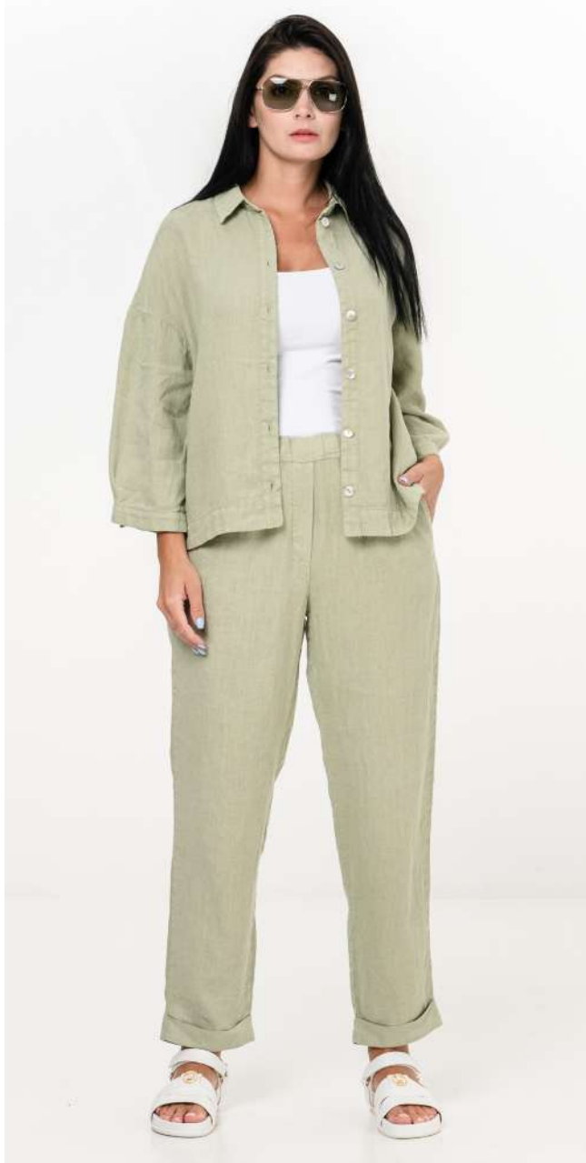
Shirt 4013 / Trousers 449