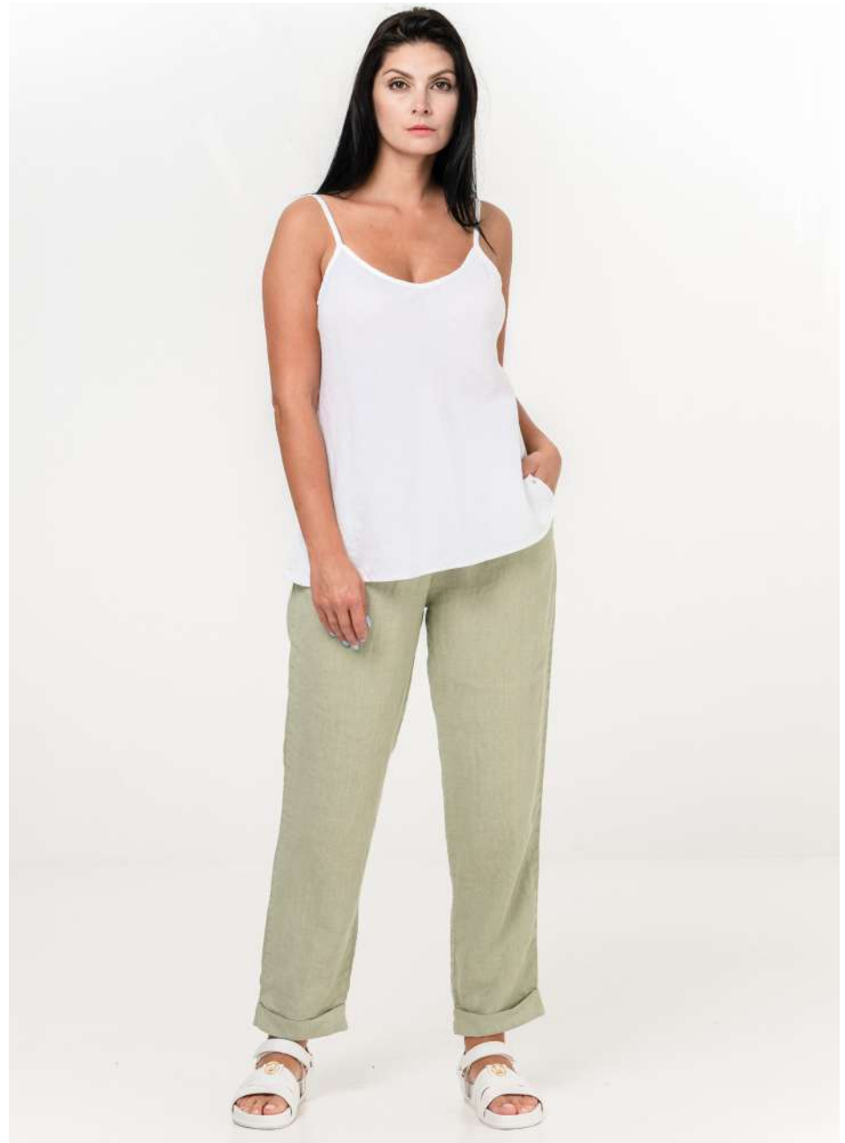
Top 020 / Trousers 449