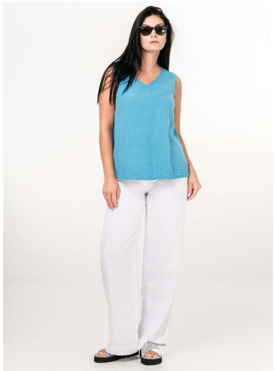
Top 030 / Trousers 1002