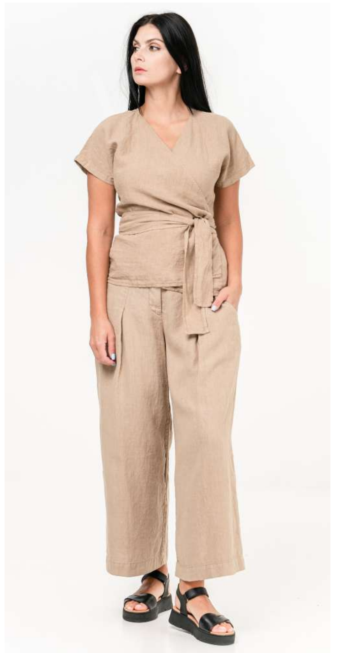
Blouse 1066 / Trousers 1014