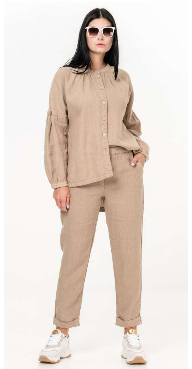
Shirt 4597 / Trousers 449