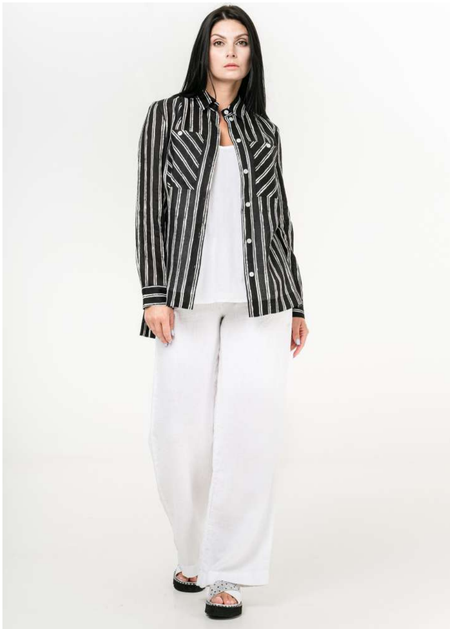
Shirt 025 / Trousers 1002