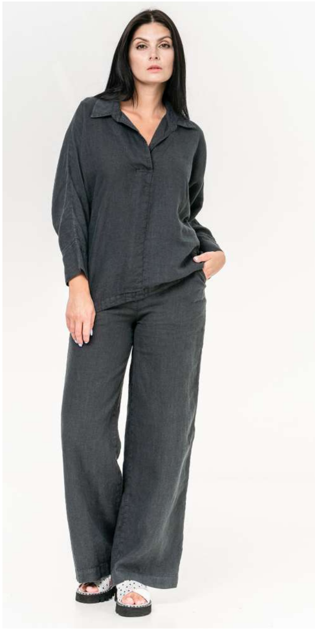
Shirt 3028 / Trousers 1002