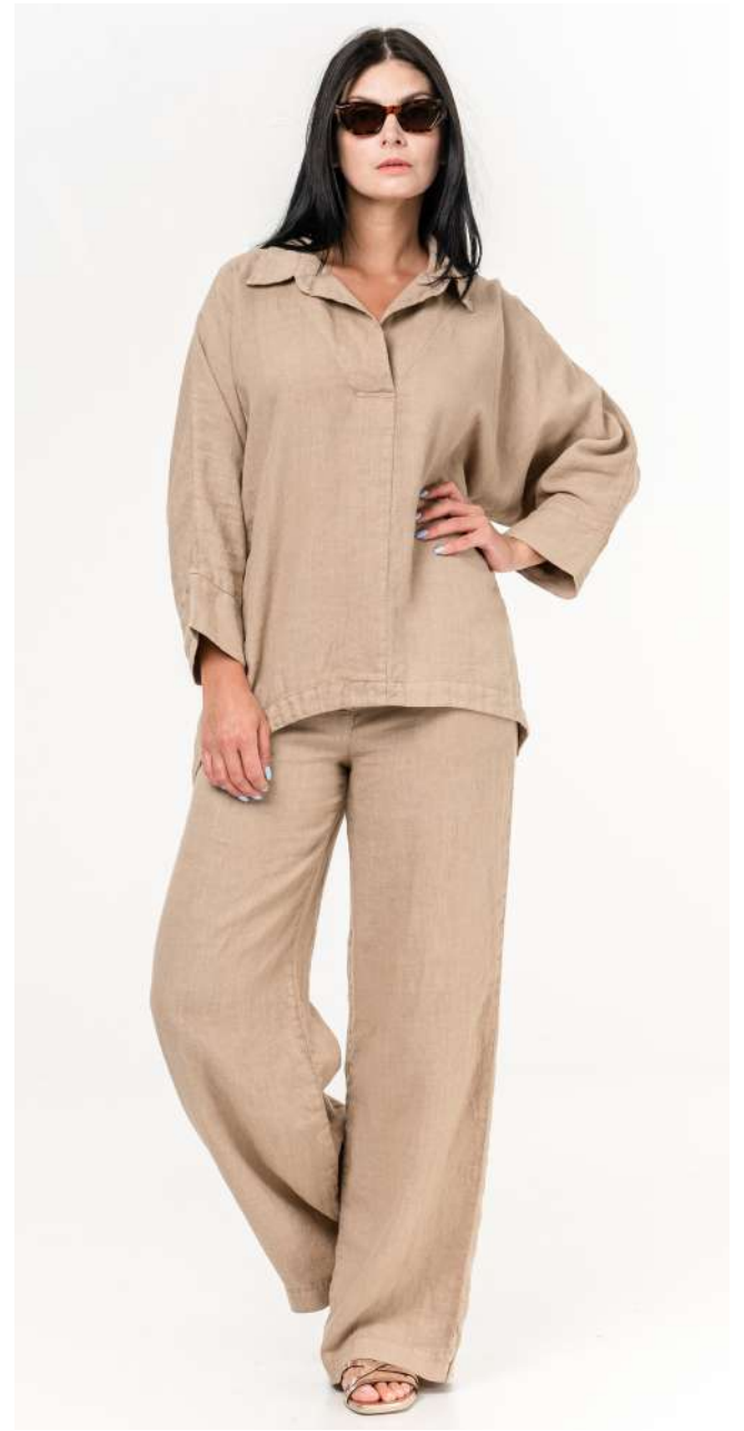
Shirt 3028 / Trousers 1002