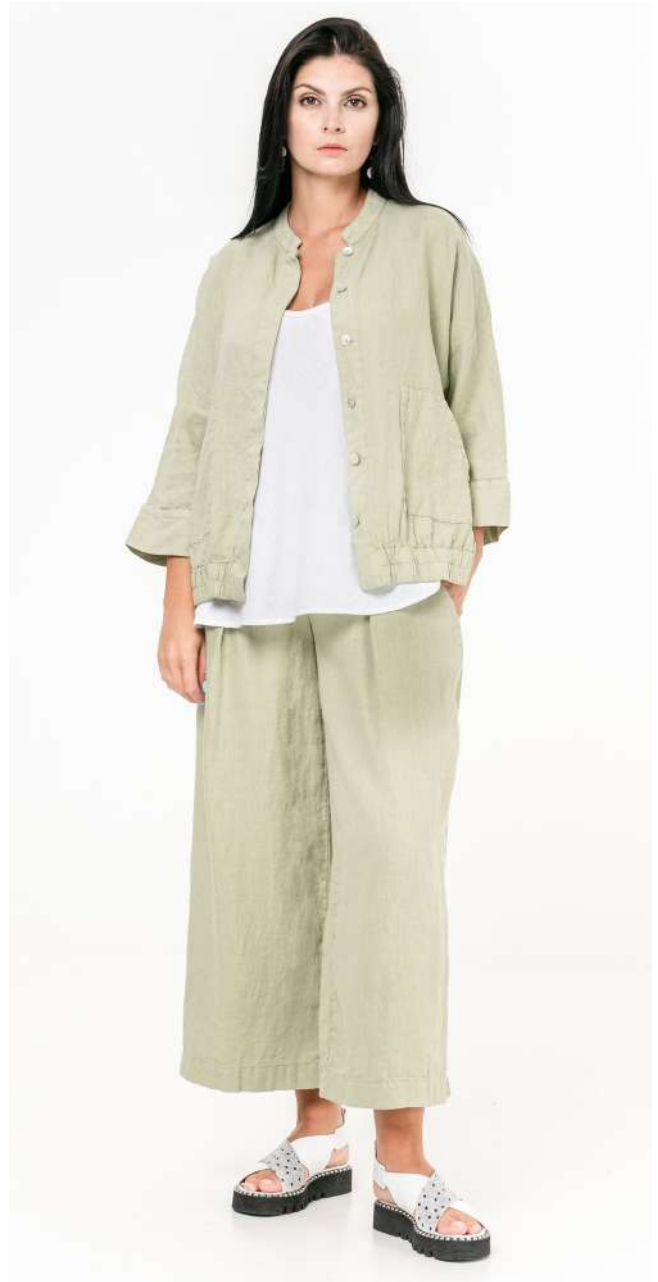
Jacket 1032 / Trousers 1014