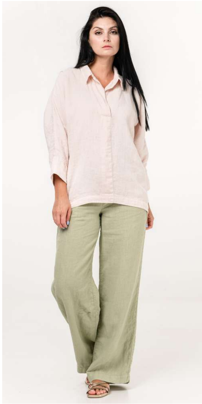
Shirt 3028 / Trousers 1002