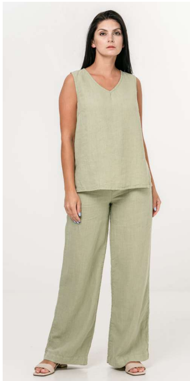
Top 030 / Trousers 1002