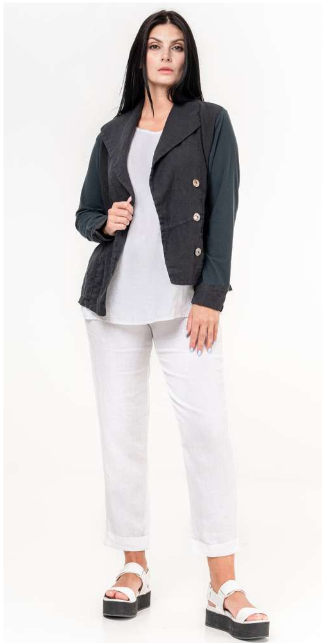
Jacket 1016 / Trousers 449