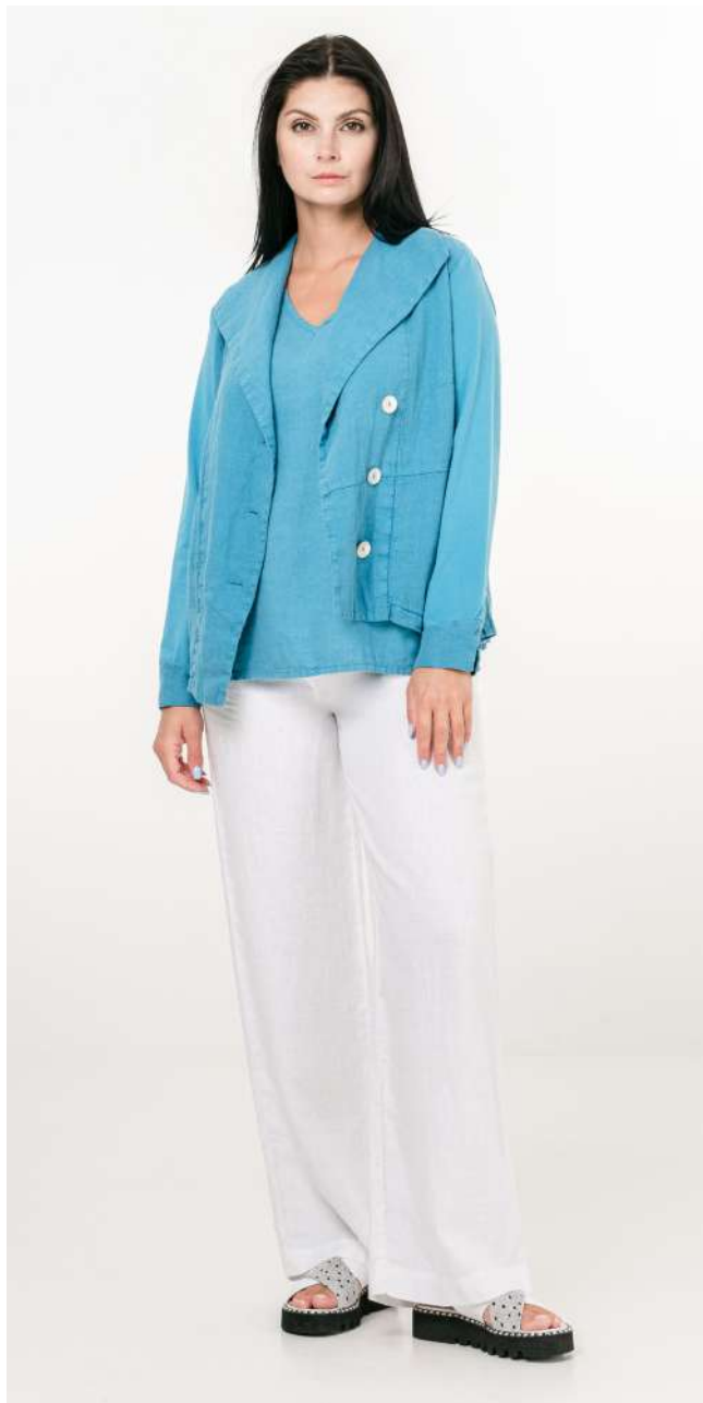
Jacket 1016 / Trousers 1002