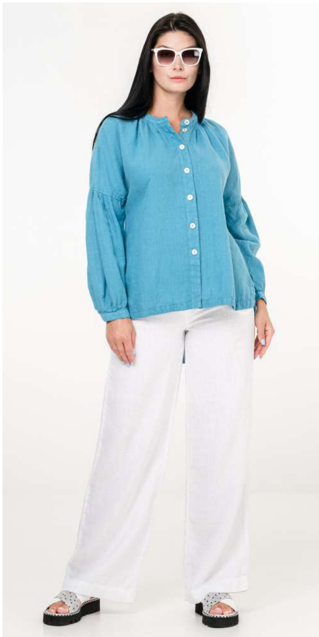
Shirt 4597 / Trousers 1002