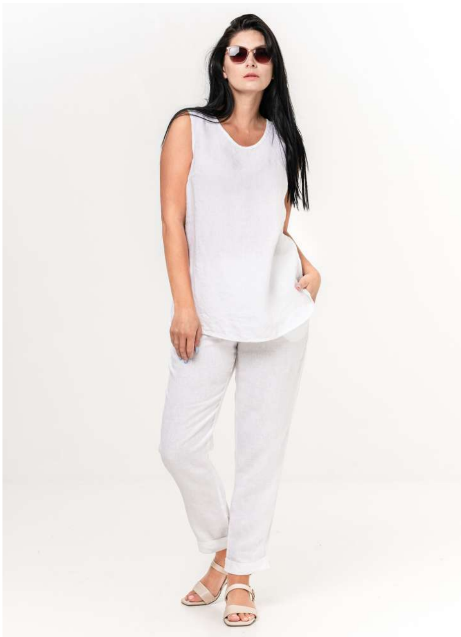
Top 010 / Trousers 449