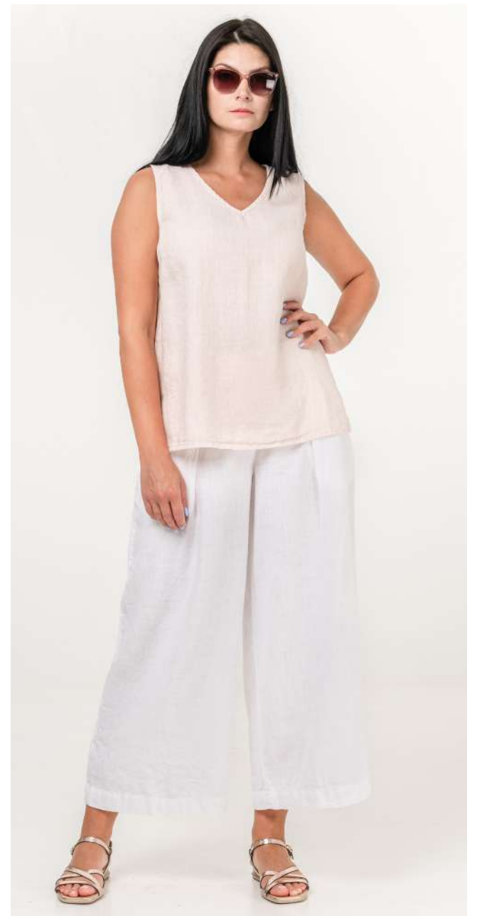
Top 030 / Trousers 1014