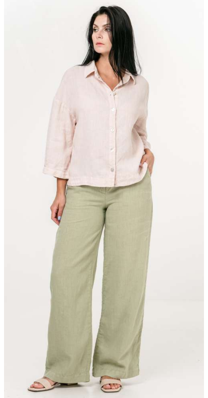
Shirt 4013 / Trousers 1002