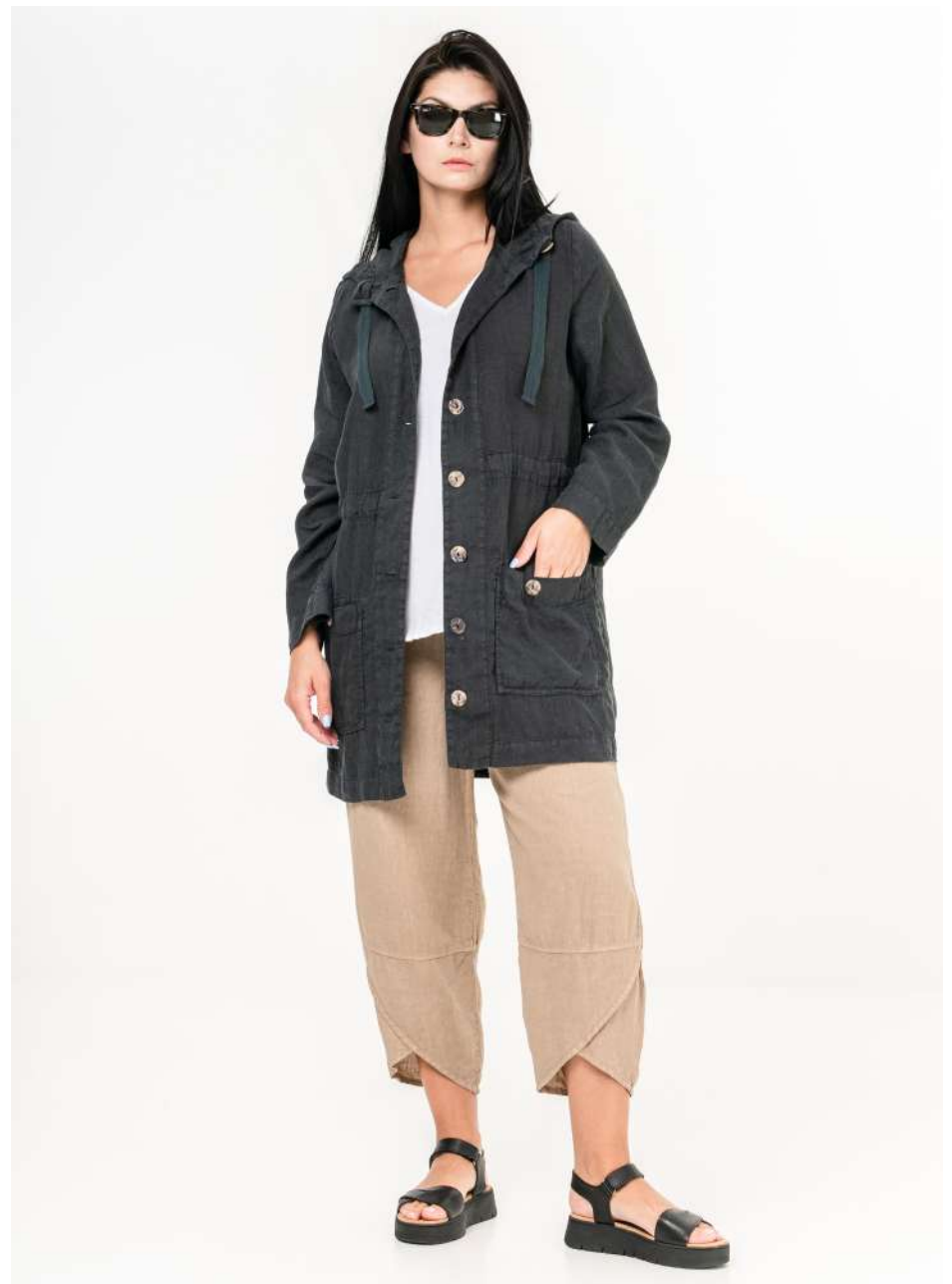
Jacket 1070 / Trousers 454