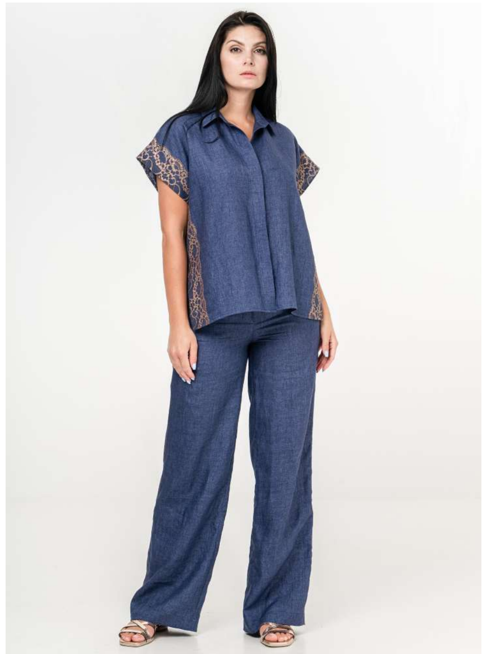
Shirt 8067 / Trousers 8069