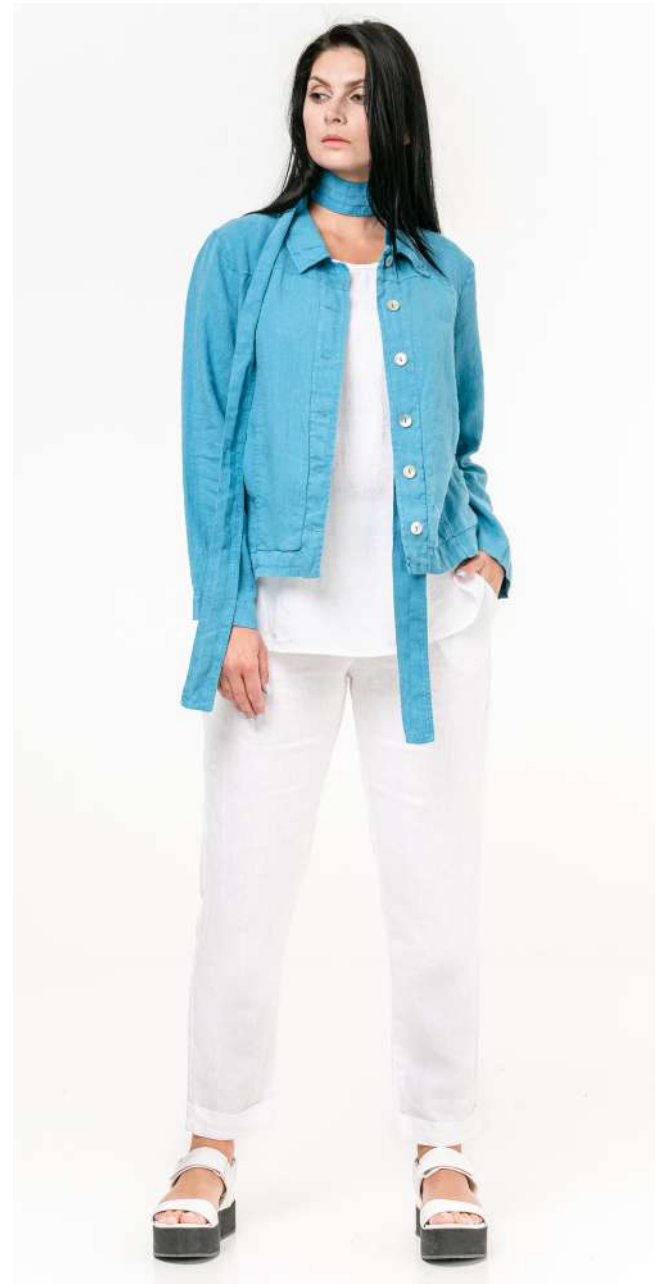
Jacket 1011 / Trousers 449